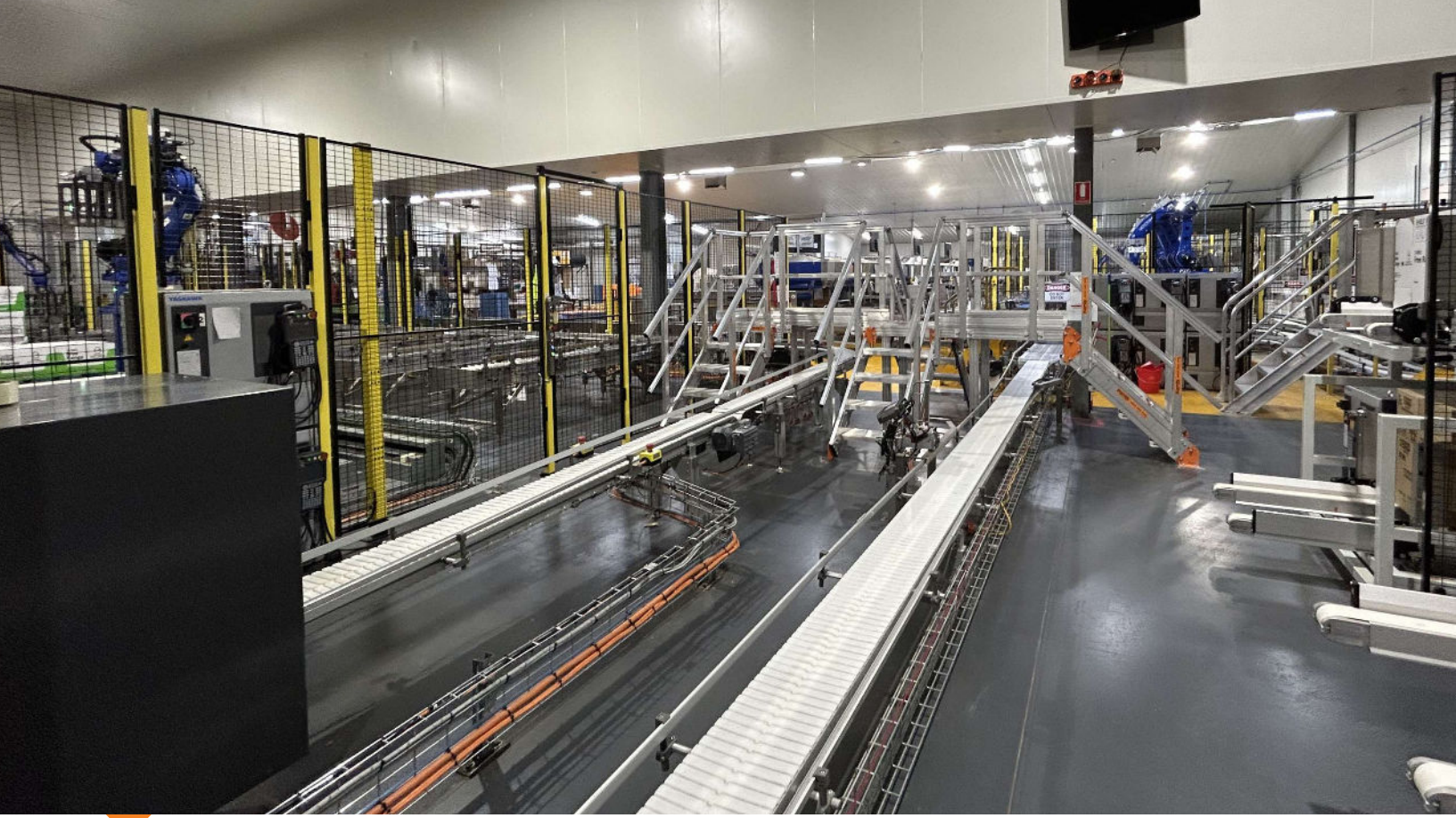
Crossover platform system allowing safe access to four different areas along the conveyer belt operation.