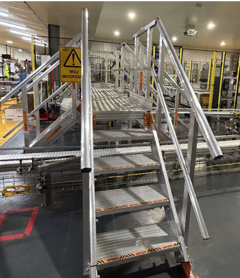
Industrial stair system for safe access onto the platforms.