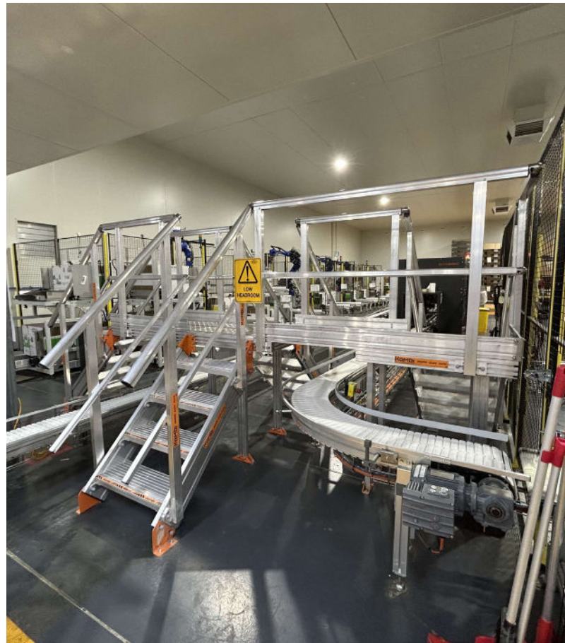
Stair system displaying the quality of workmanship our installers pride themselves in.