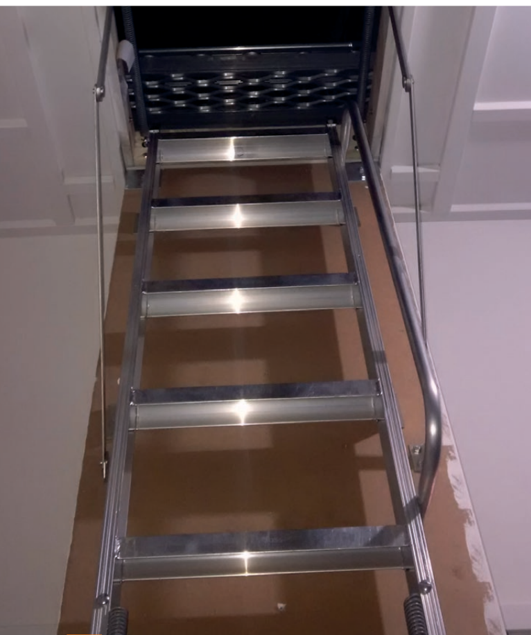
Fold down Ladder for accessing roof space.