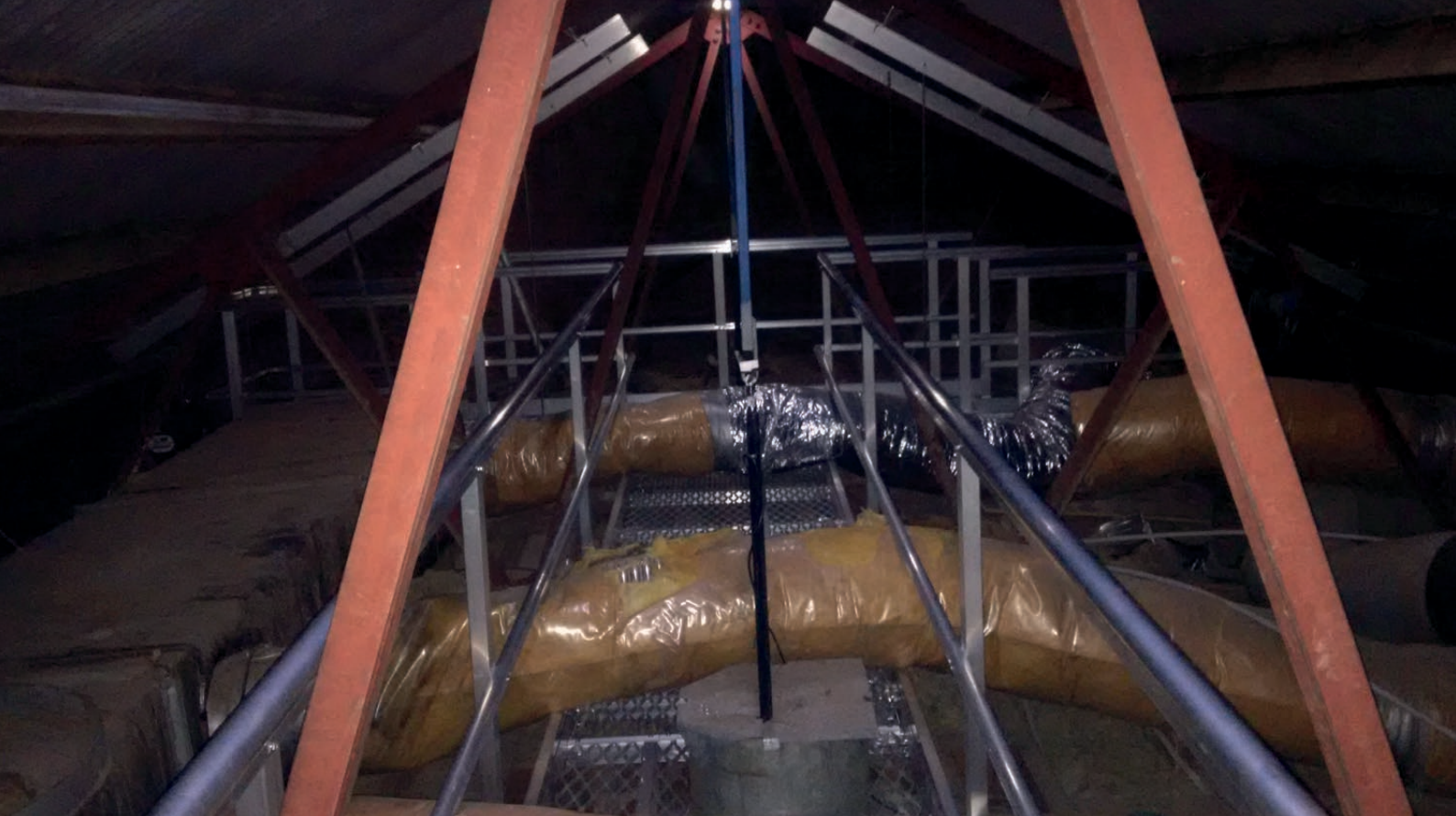
Suspended walkway through roof space in theatre roof for accessing projector hoists.