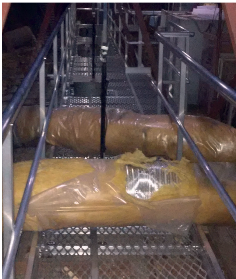
Our installers are experienced in working in confined space areas and have all the required tickets.