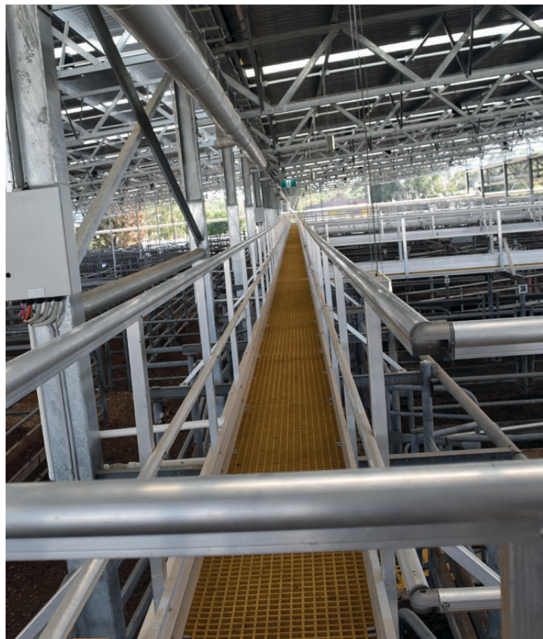
Quality workmanship by our qualified installation crew.