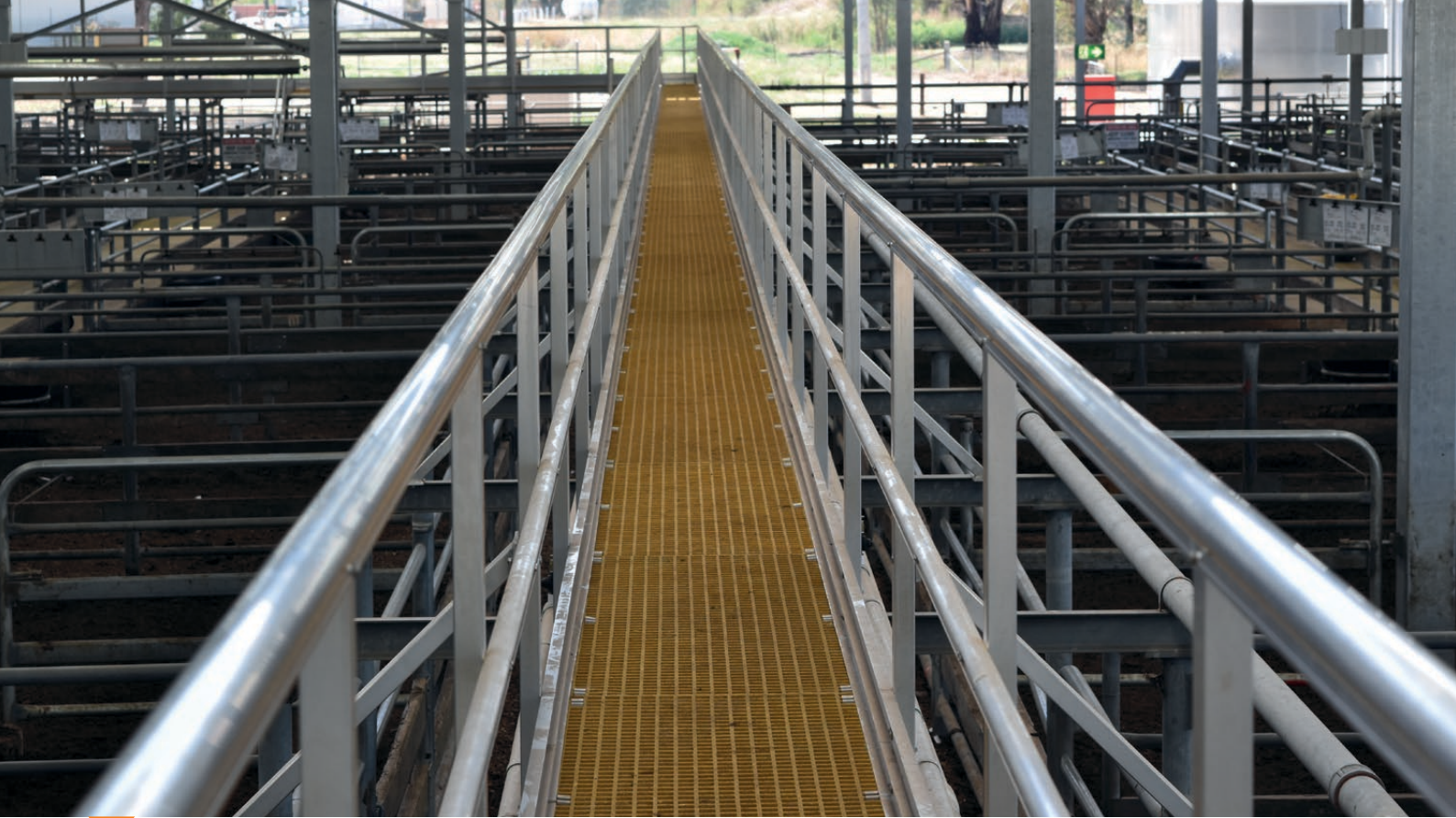
Elevated Fibre Reinforced Polyester walkway with double sided guardrail, for auctioneers to walk along at the Wangaratta Livestock exchange.