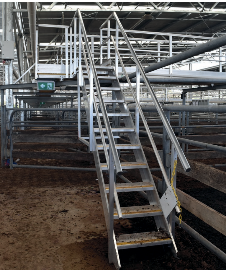
Aluminium Stairway for access up onto the elevated walkway.