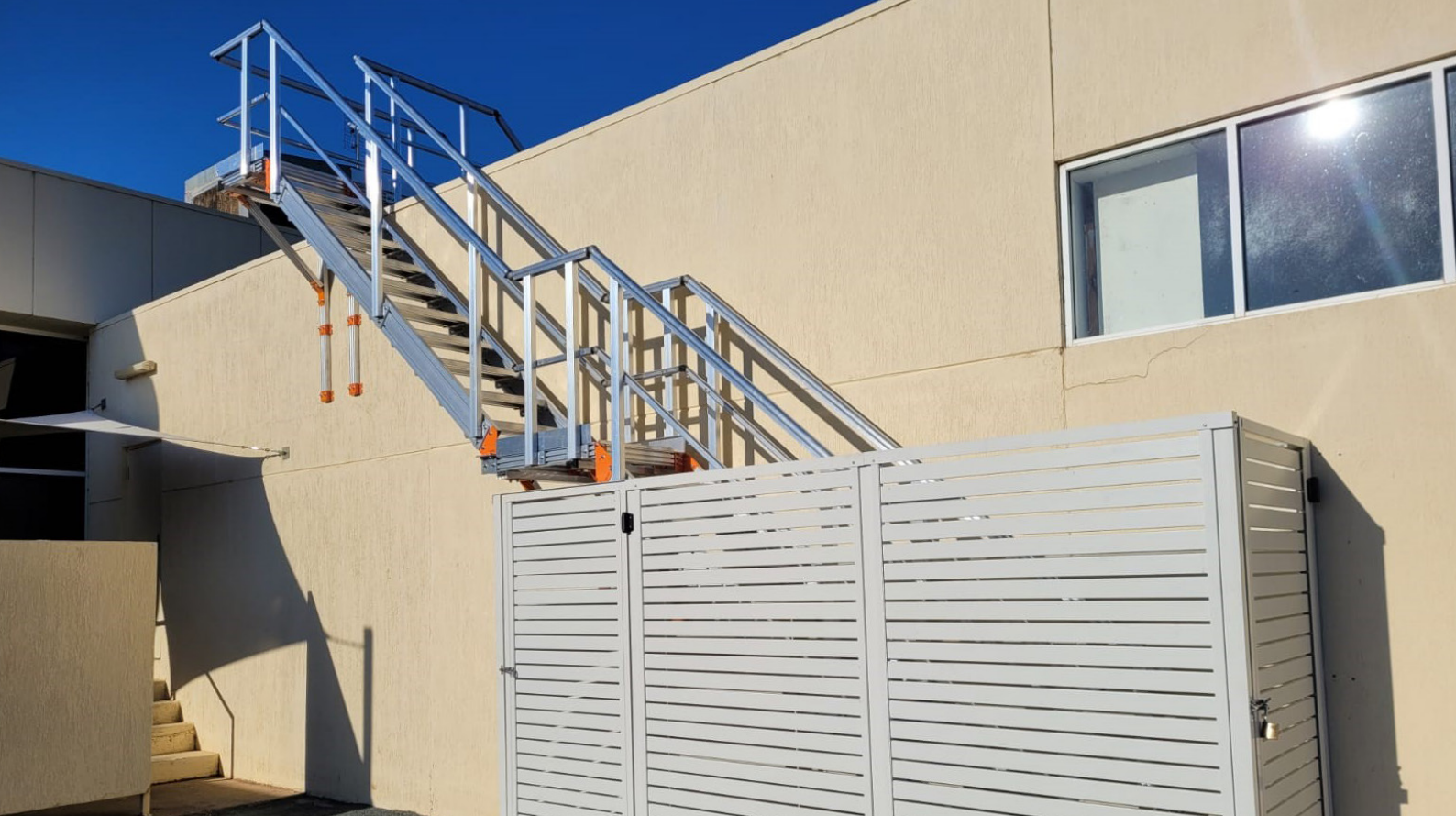
Stairway access to the roof with a custom security screen around the base.