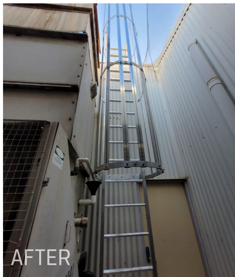
Upgraded ladder system with a landing platform for safer and easier access to the roof.