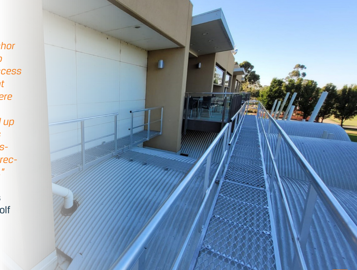
Extended walkway allowing access to the windows and other essential equipment.