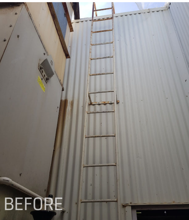
Old access ladder no longer compliant to the Australian Standards