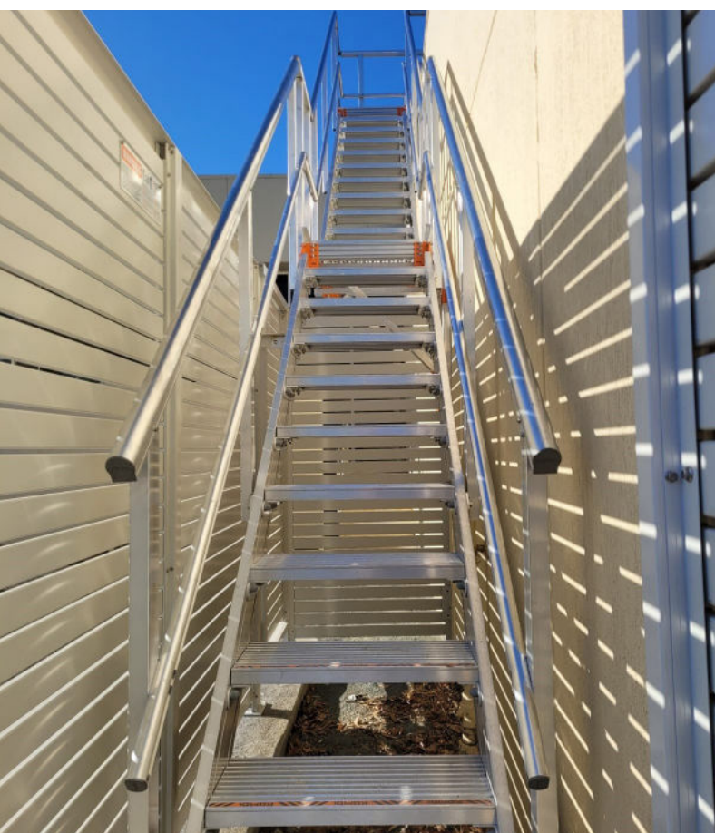
Custom Stairway access