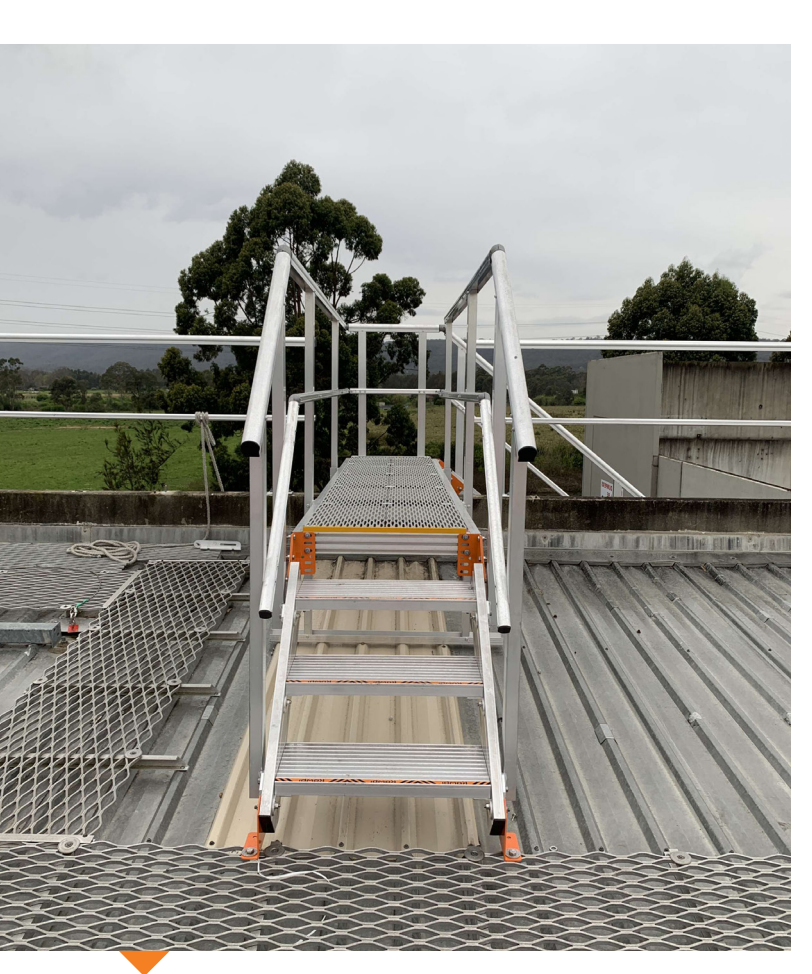
Stairway landing platform