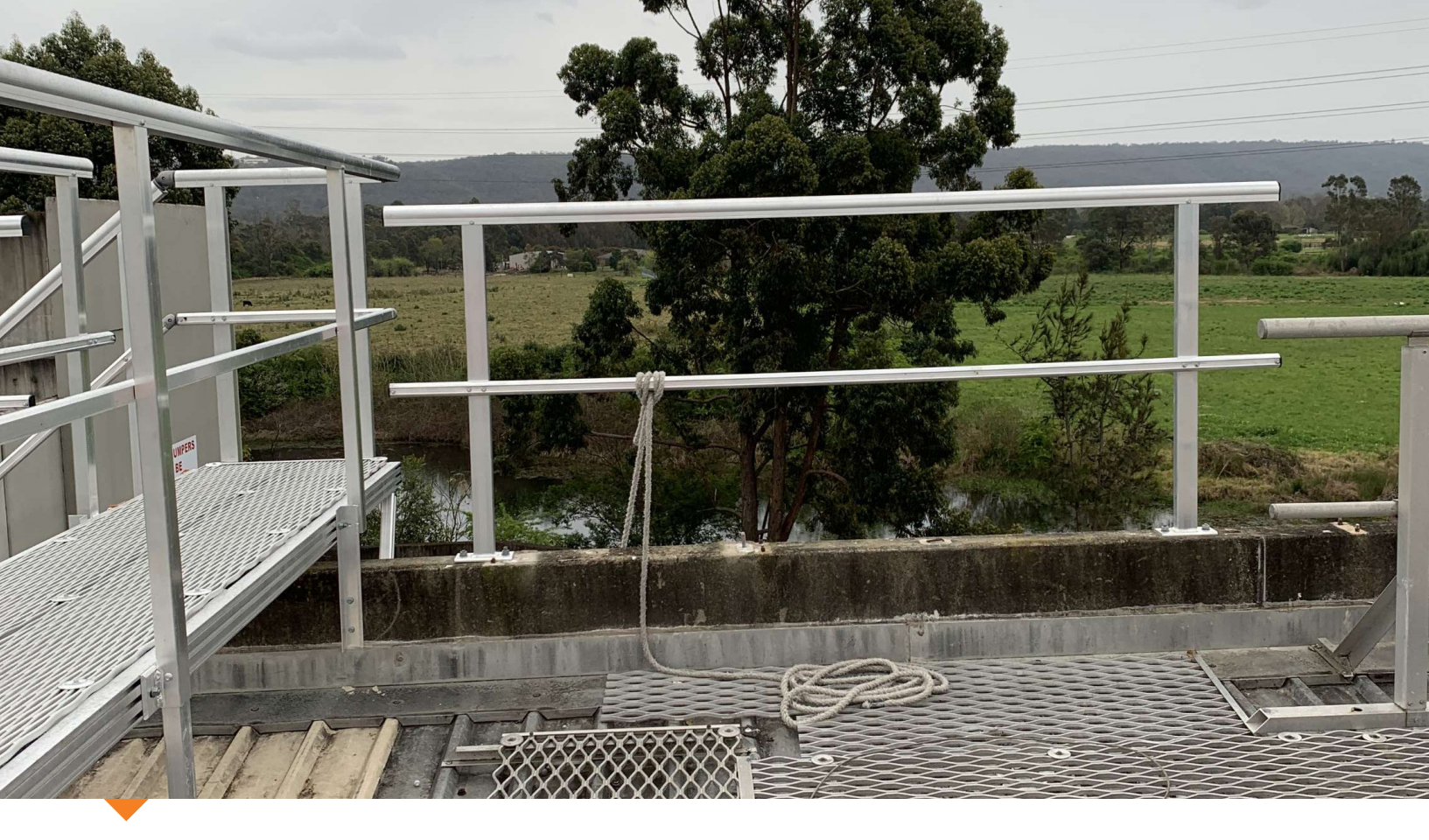
Guardrail & walkway system eliminating active fall edge