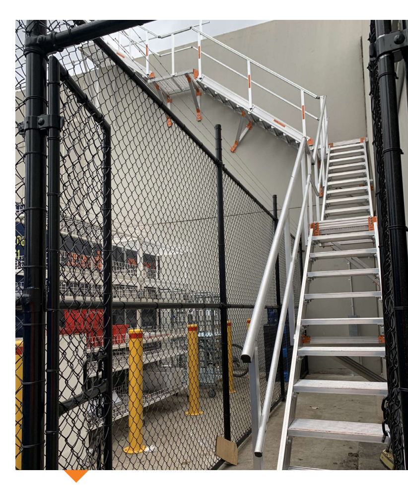
Security fence installed to ensure unauthorized access is eliminated.