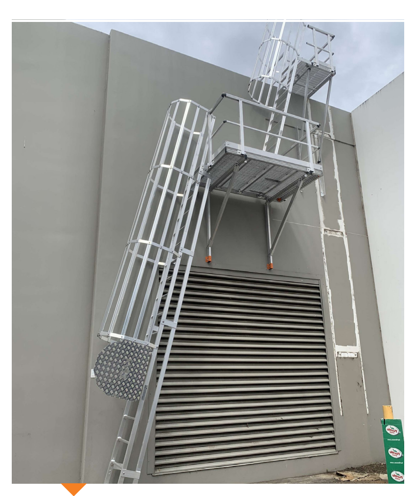
Angled caged ladder with landing platform & lockable gate