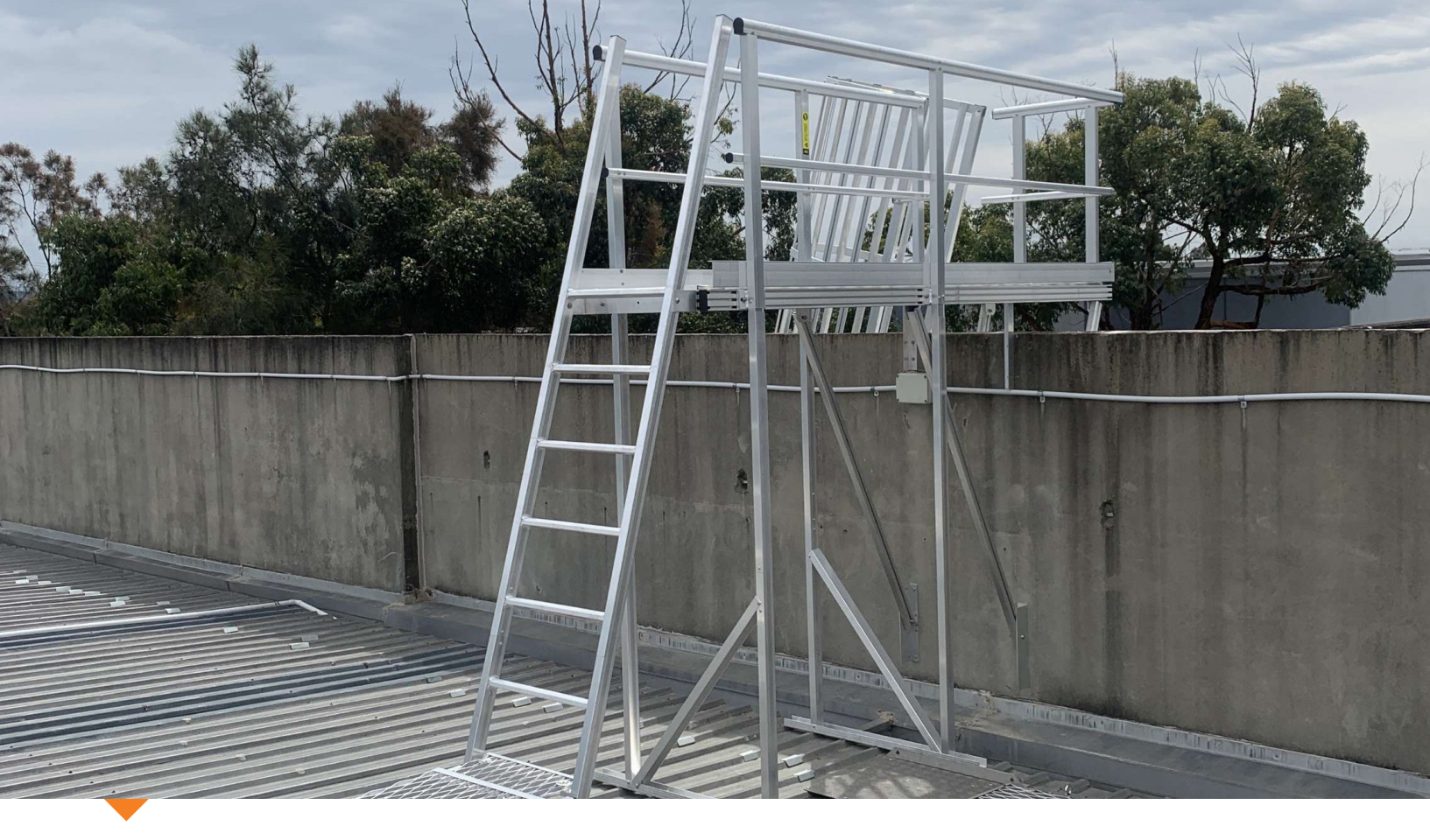
Landing platform and ladder system