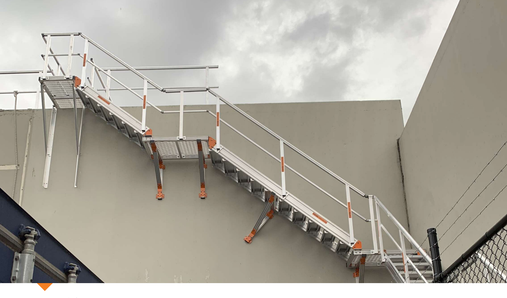
4 stage Stairway system