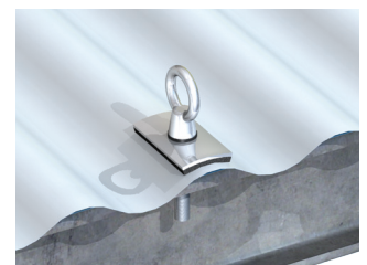
AP 123C PURLIN MOUNT ANCHOR