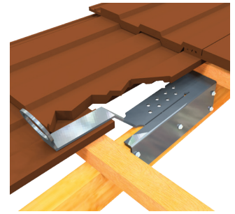
TIMBER MOUNT ANCHOR KIT