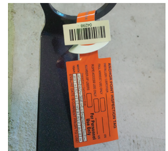
ANCHOR LABEL ATTACHMENT