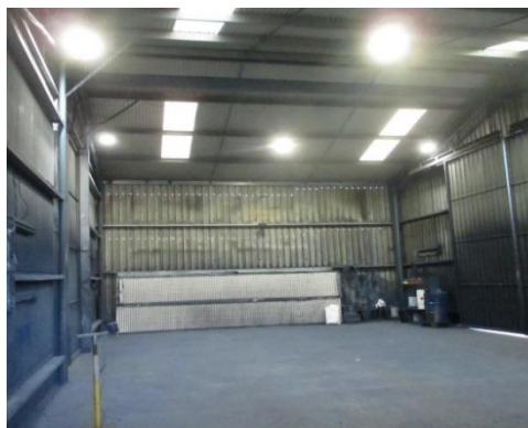
The shed where the carpenter fell, noting the perspex roof sheeting

Last month a 21-year-old apprentice carpenter fell through perspex roof sheeting at a manufacturing plant in central western NSW. He landed on the concrete floor 7 metres below, fracturing his wrist, ribs and pelvis.