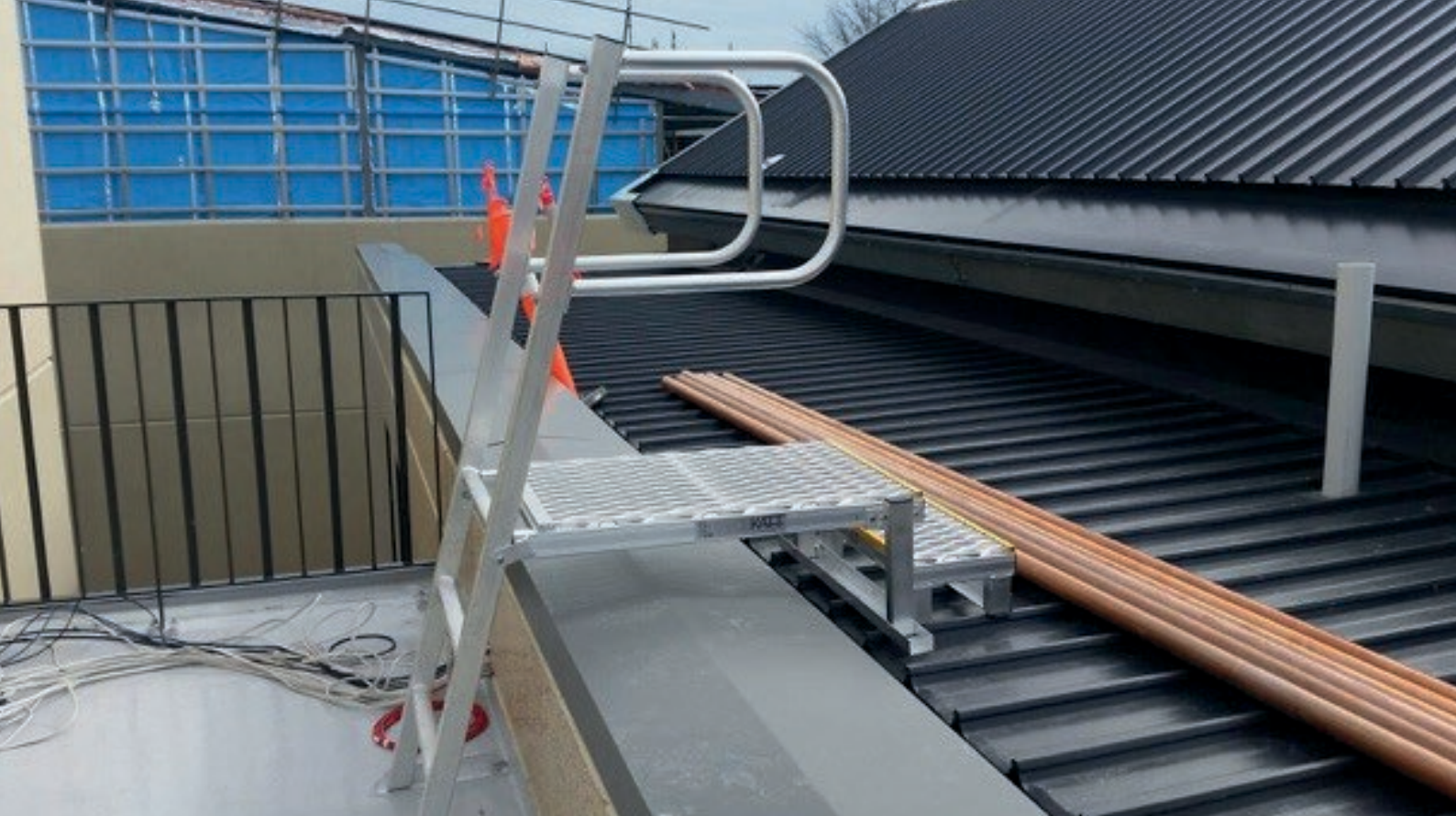
Mini Access Ladder from concrete landing onto roof area.