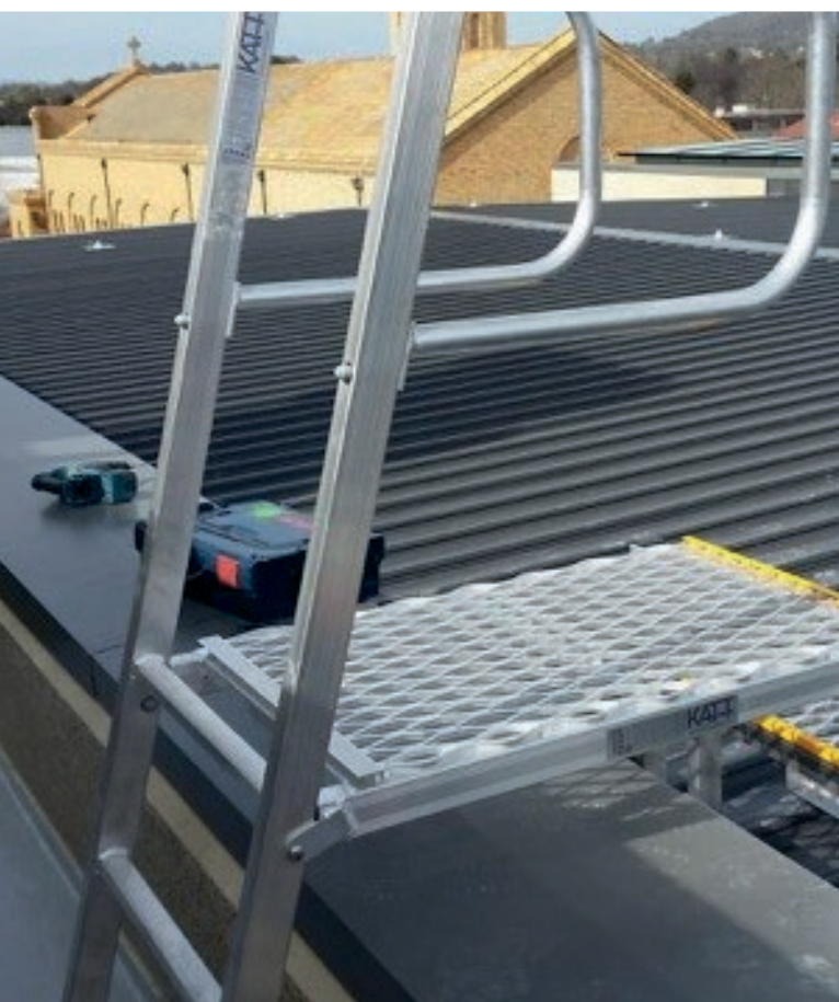
Photo displaying top landing platform.