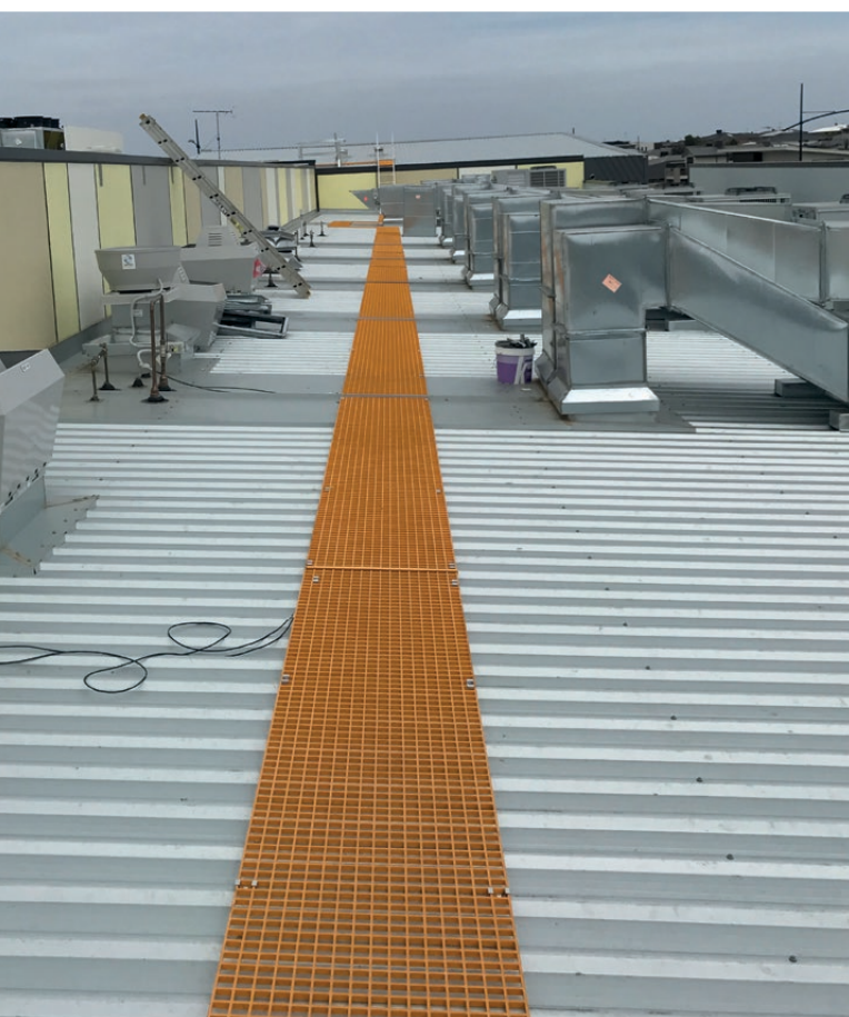
FRP walkway straight as a die, showcasing our installers quality workmanship.