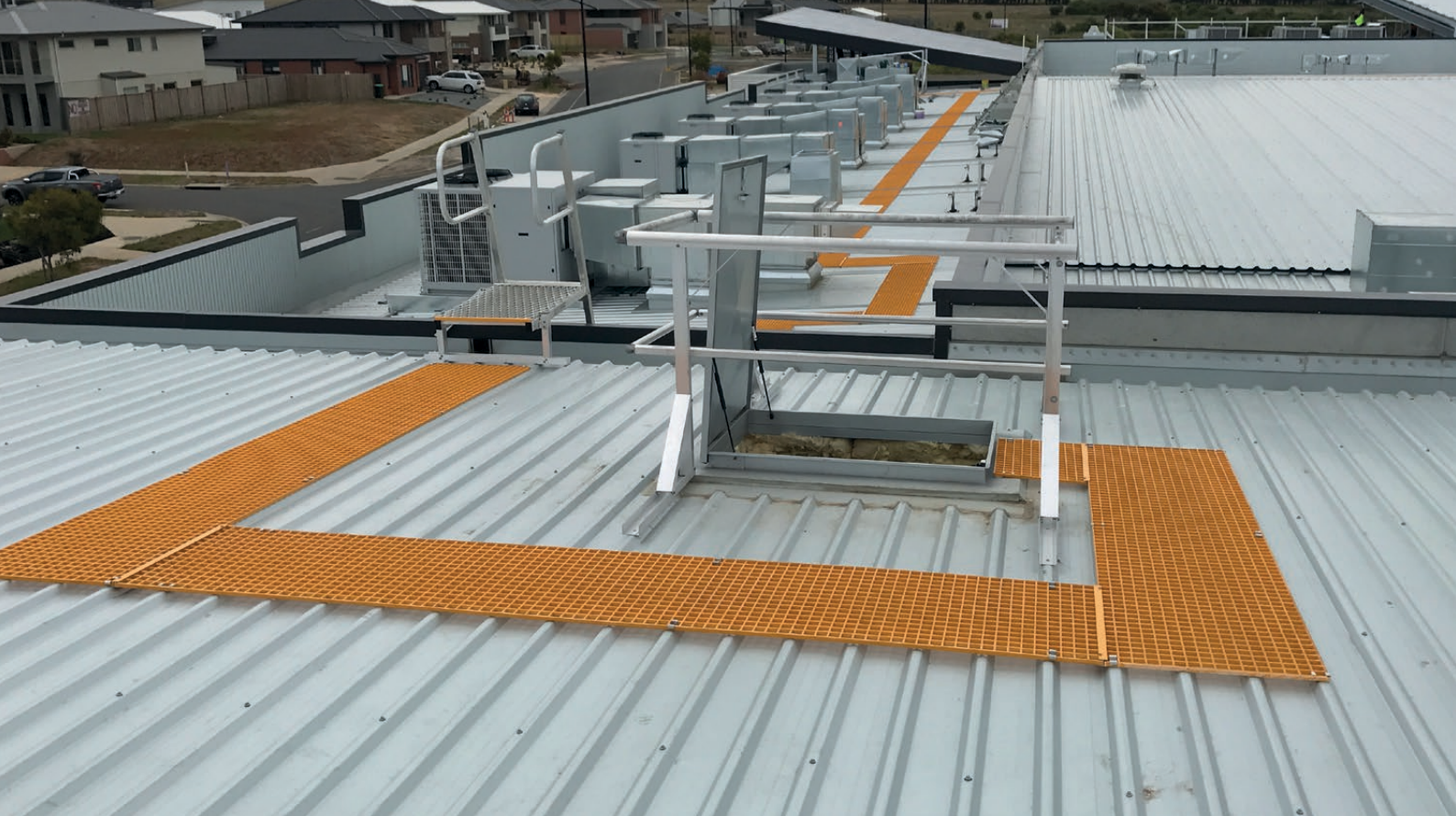
This photo showcases one of our roof access hatches, an access hatch guardrail kit, Fibre Reinforced Polyester Walkway and a mini access ladder which all makes easy access to plant and equipment on the roof.